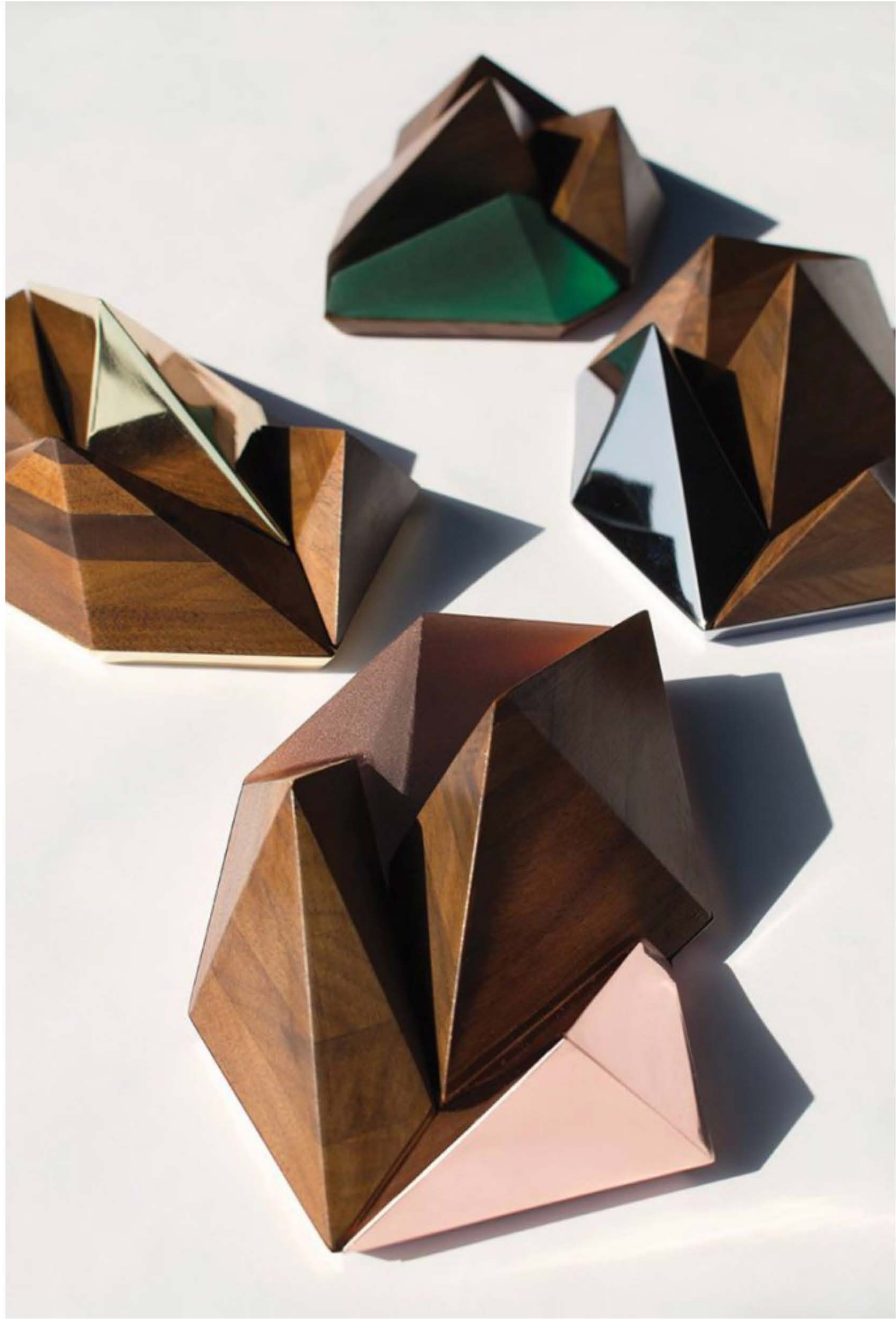
Confrontation, Venice Design