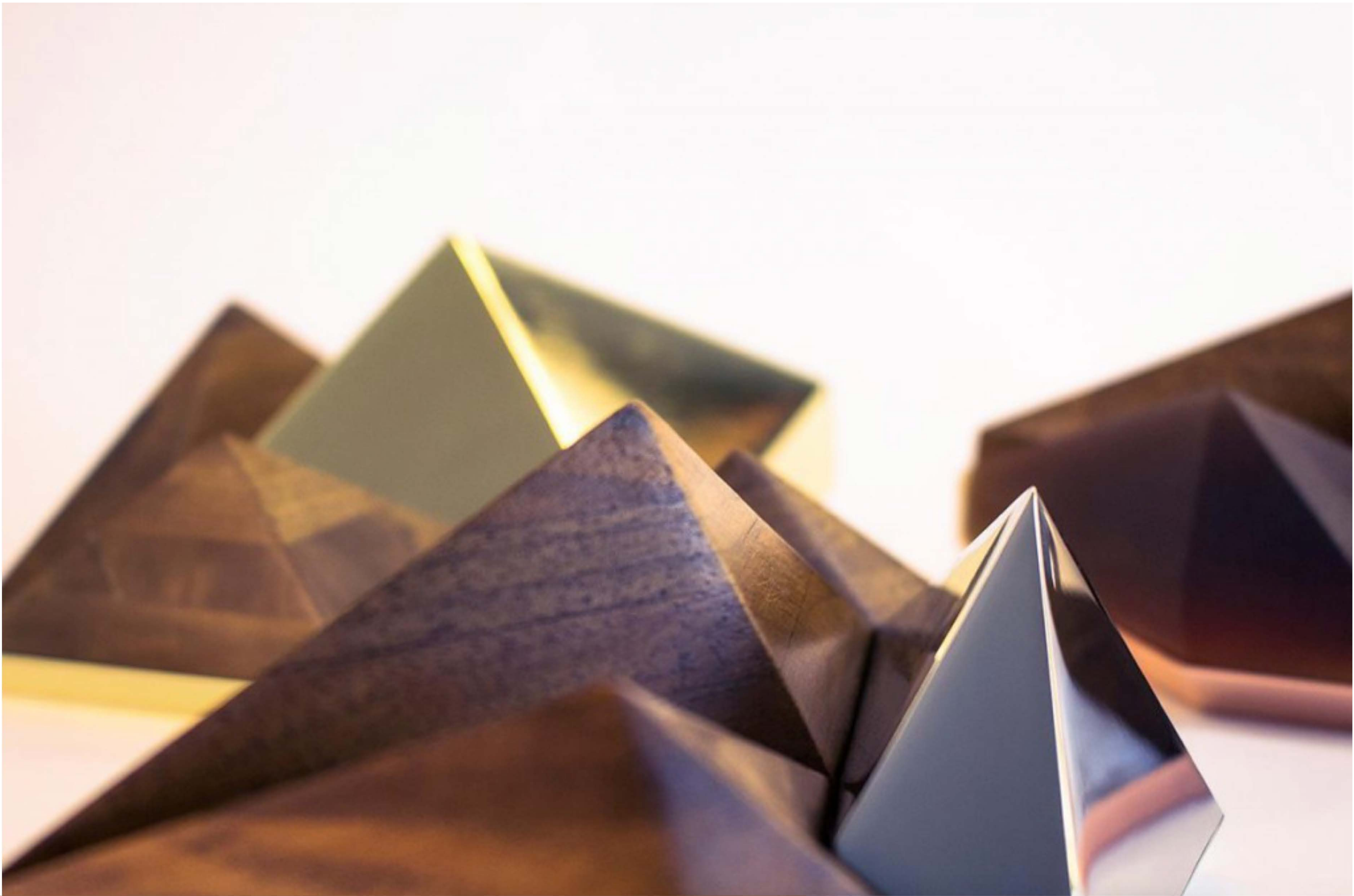
Confrontation, Venice Design