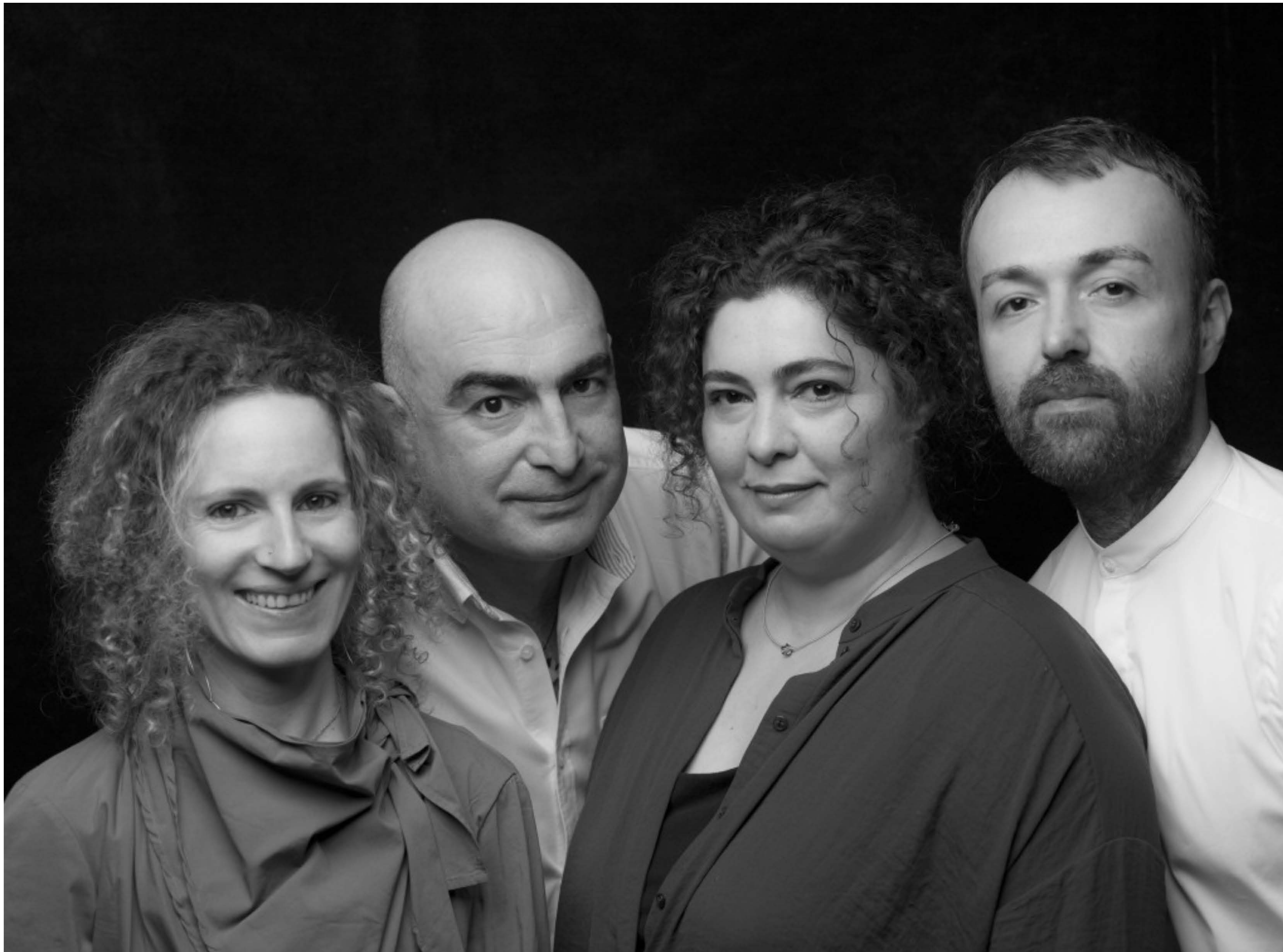
The Demirden Design team